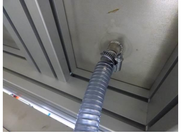
Connection vacuum line from the