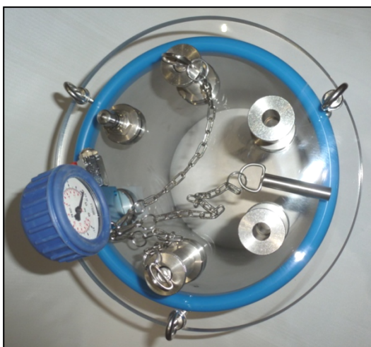
Pic. 5: Top view