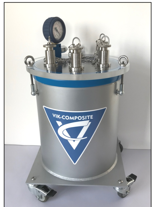
Pic. 1: SK3VAC-15L4WS12x4