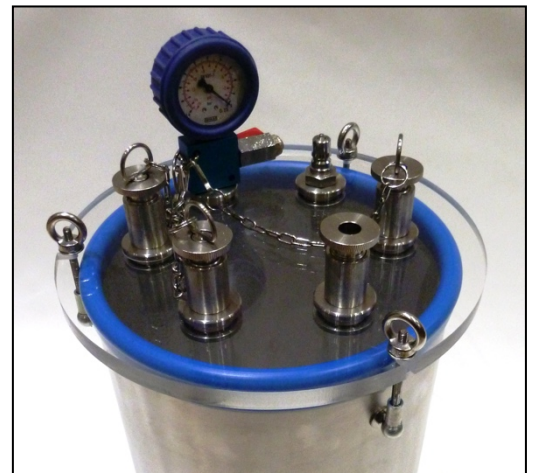
Pic. 1: 4 channel cover without vacuum level regulator