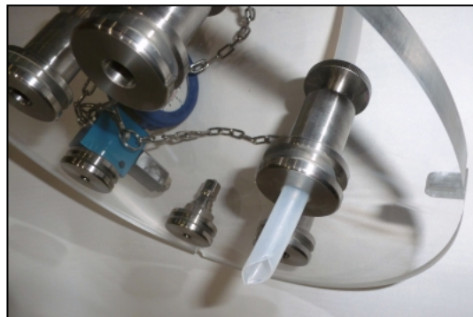
Pic. 3: Open cover with clamped tube