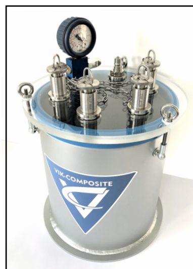
Pic. 6: SK3VAC-15L0WR12x4

The product can slightly differ from the photo depending on complete set.