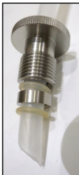
Pic. 2: Fitting