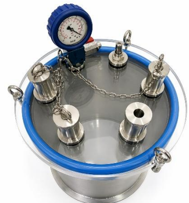
Pic. 4: Top view

Technical values are provided to the best of our knowledge and are based on data considered reliable. Users are responsible for verifying suitability and assume all associated risks.