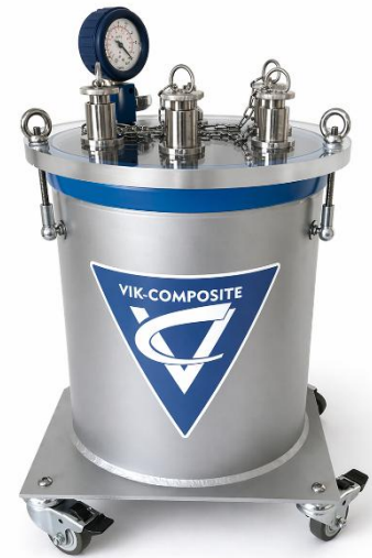
Pic. 1: SK3VAC-15L4WS12x4