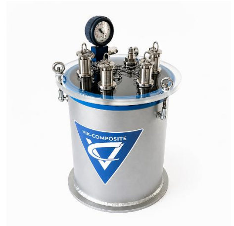
Pic. 5 SK3VAC-15L0WR12x4