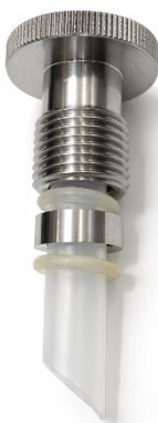
Pic. 2: Open connection