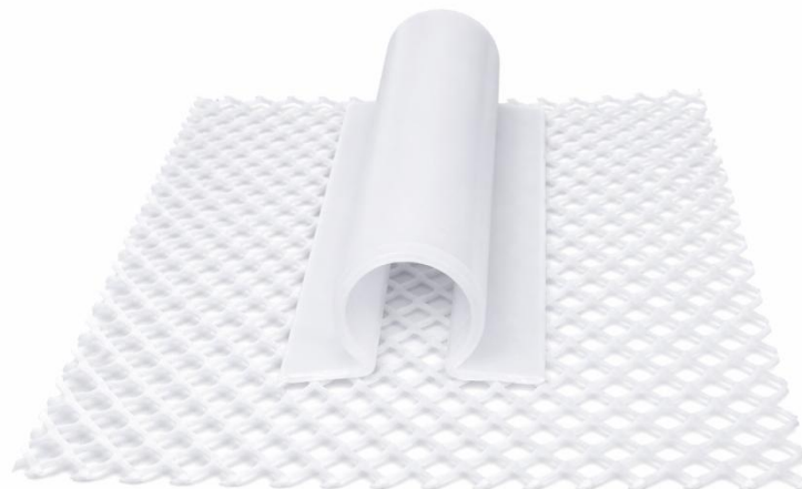
Omega flow line SK2RIM120-5 with low print belt SK2RIM120-3